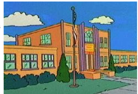
UNWS, whose research found that 90% of commerce law students exist one year after graduation.

“I remember fondly my lectures on legal activism, and feeling sorry for those who will be paid less than me to do that kind of stuff.”